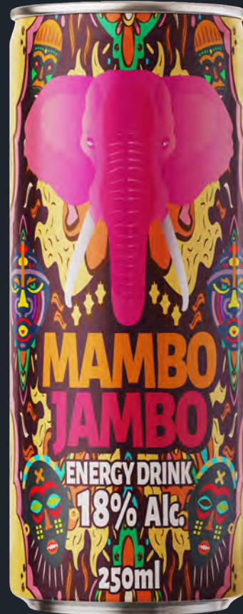
Mambo Jambo With alcohol